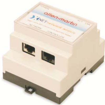
allen·martin XNET network module

We're moving to the next level of Energy Management - and we want you to join us.